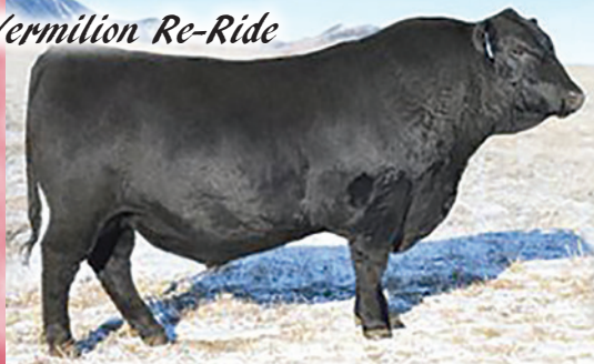
Herd Sire - Son of Connealy Spur AAA +18508640 BD: 2/10/16