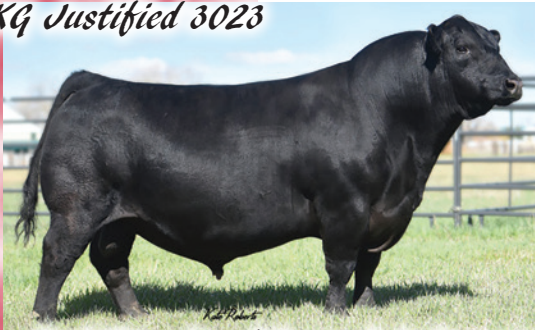
Herd Sire - Son of Connealy Judgment AAA +17707279 BD: 1/21/2013