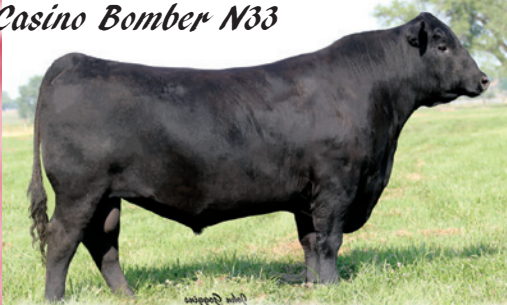
Herd Sire - Son of KM Broken Bow 002 AAA +18658677 BD: 1/29/2016